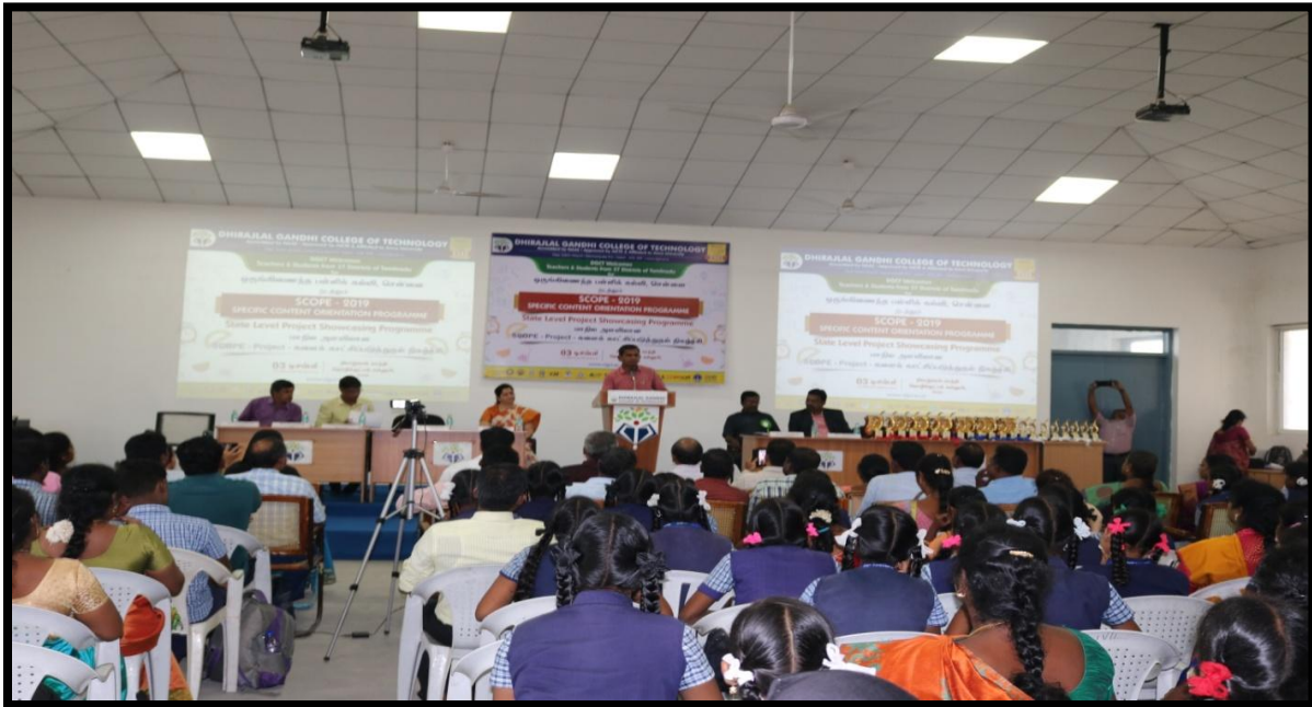
Given facility to Conduct State Level Project Showcasing Program (SCOPE) for Government schoole students