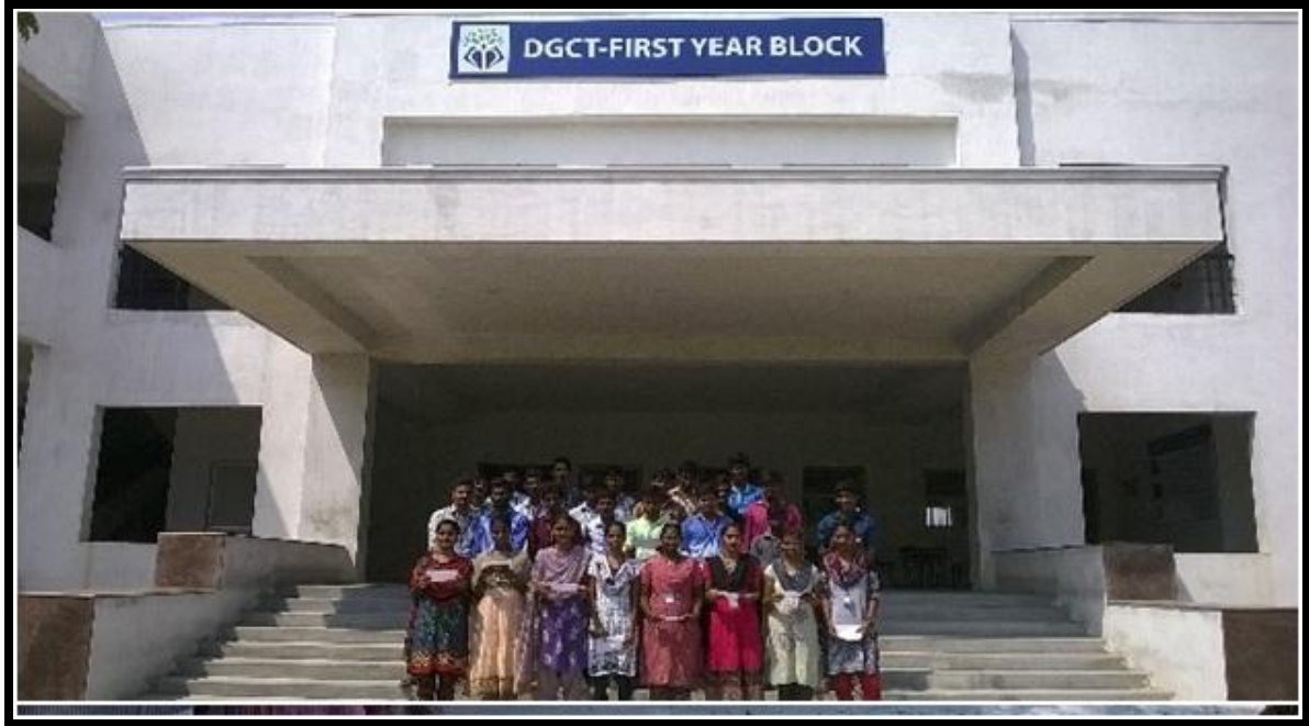
Conducted Election Awareness Camp to produce 100 voting