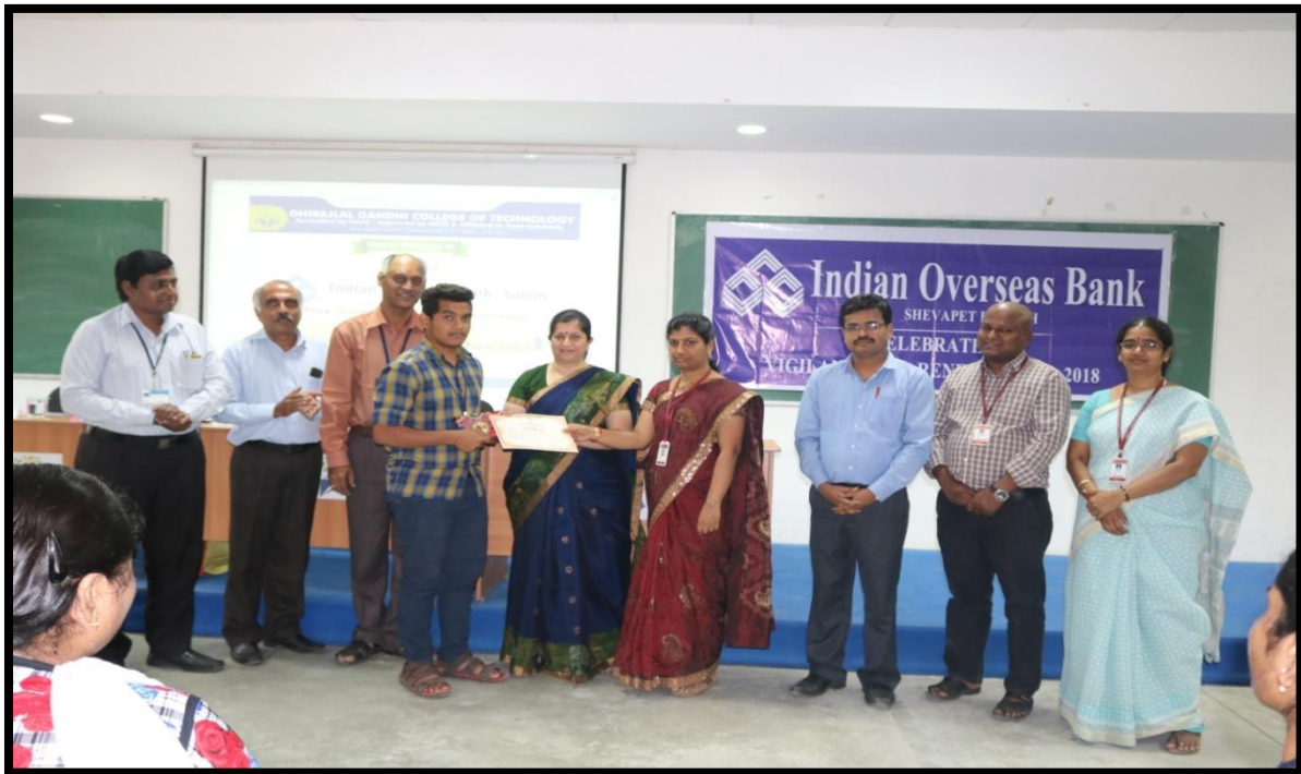
Given Indian Overseas bank Vigilance Awareness Week to student holistic development