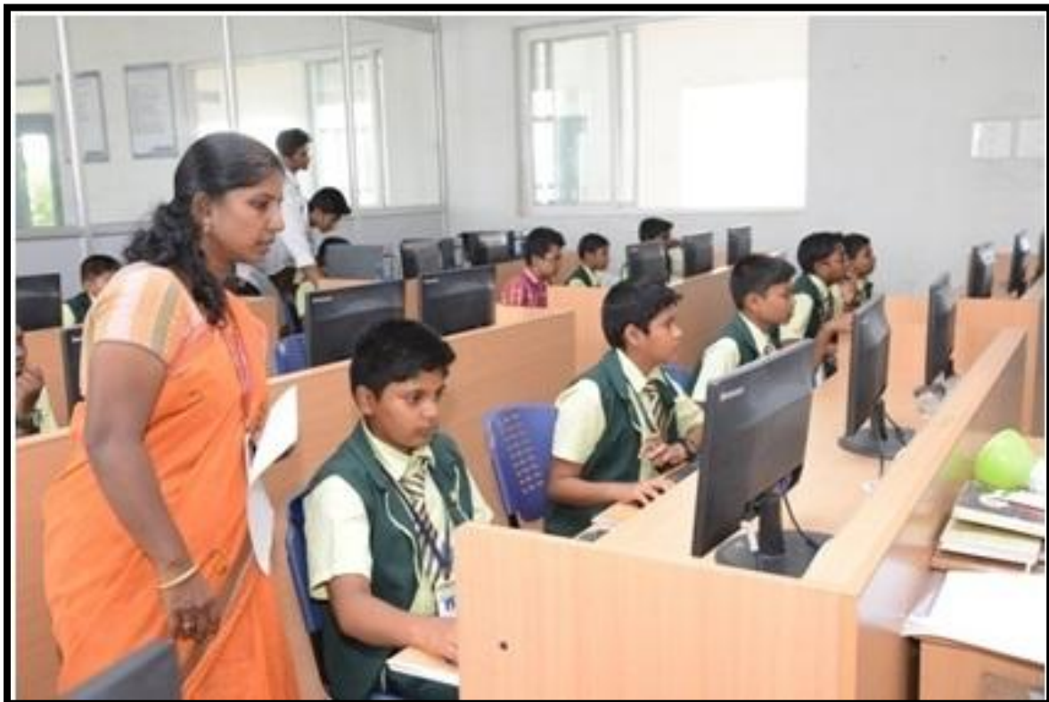
Conducting Ramanujam Math Quest for school students