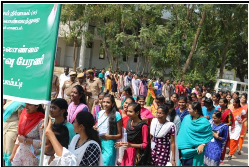
Disaster Management Awareness Program given to Rural neighborhood community