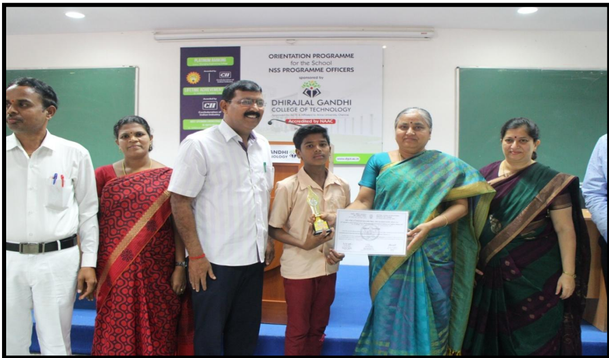
Provided an infrastructural facility to organize Orientation Program for the School NSS Program Officers to neighborhood community