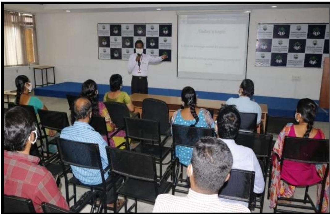
How to manage COVID - 19 environment