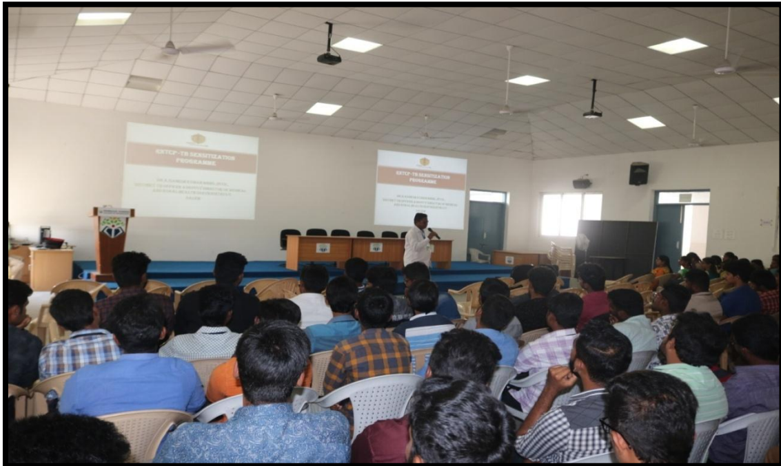
Organized RNTCP-TB Sensitization Programme