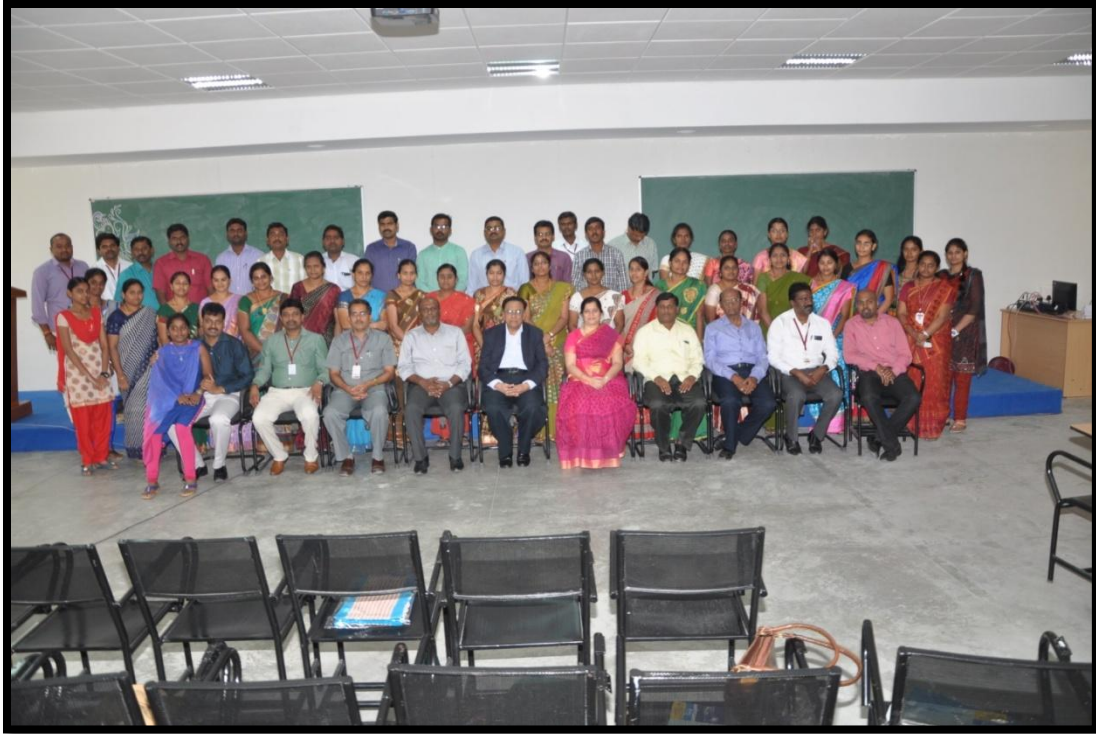
Conducted a program on Mind with Values for School teachers