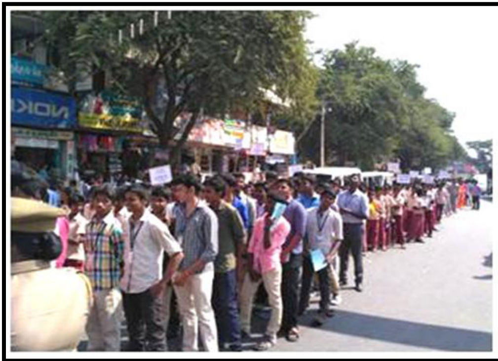
Conducted Road Safety Program for neighborhood community