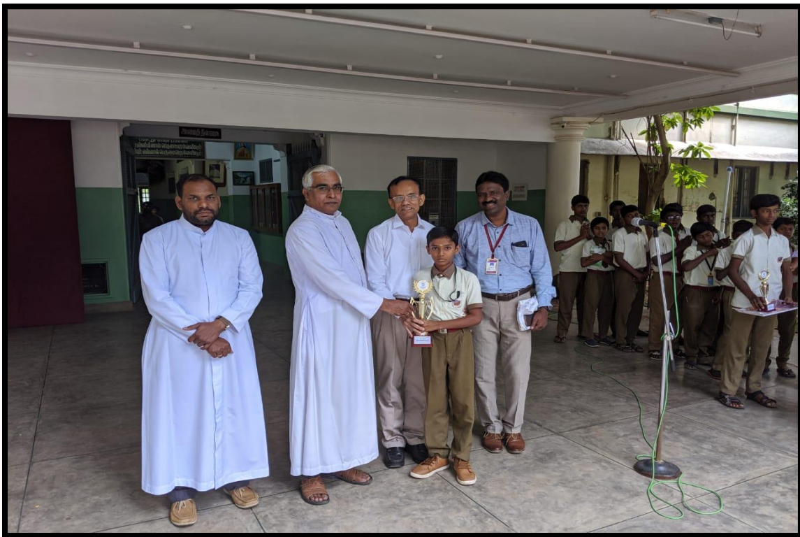
Conducting Mind with values to school students to improve their memory power