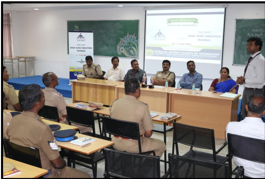
Provided infrastructural facility to conduct Basic AVSEC Induction Training Programme for AAI neighborhood community