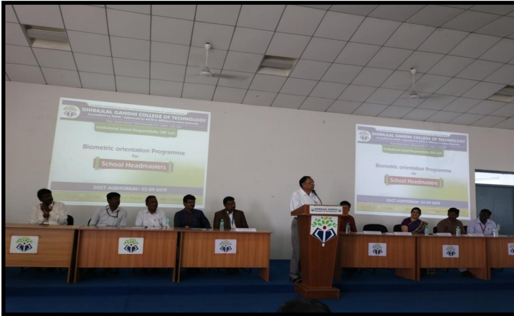
Biometric Orientation program Organized for School Headmasters to implement digital India