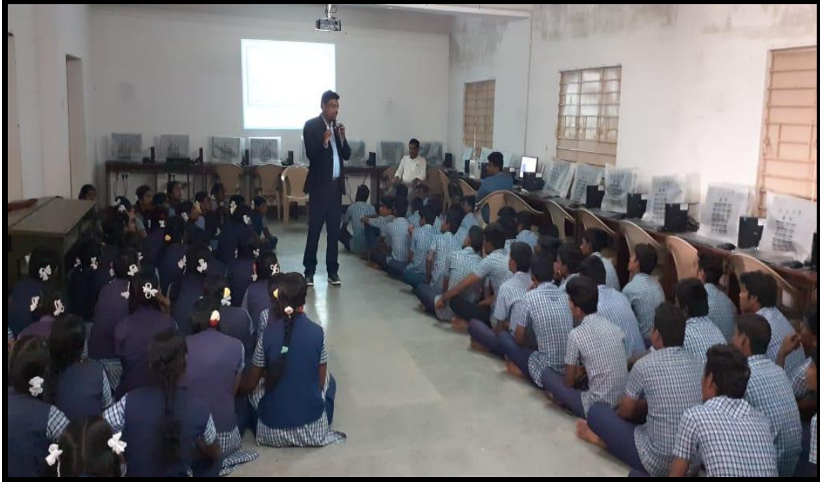
Conducting Motivational Program for Government +2 Students to increase score