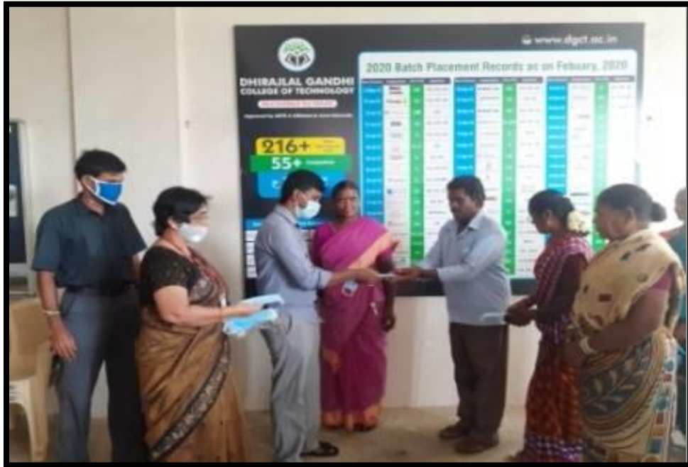
Work management and Preventive measures in COVID - 19 Situation