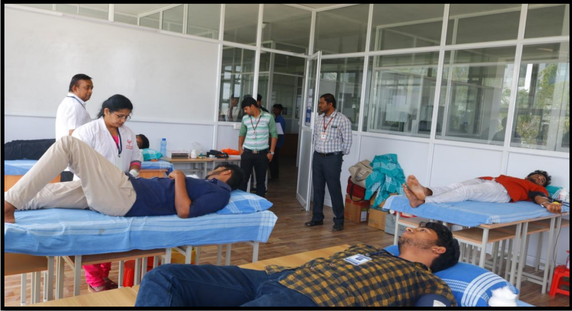
Blood Donation Camp where conducted through YRC