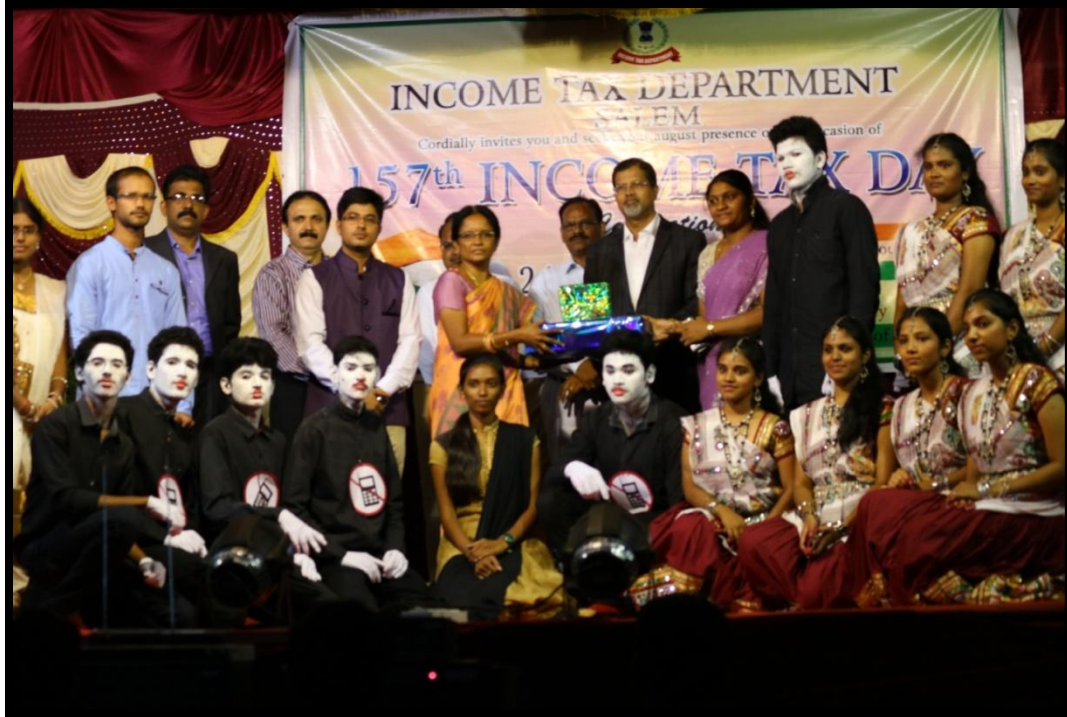
Celebrated 157 th Income Tax Day neighborhood community