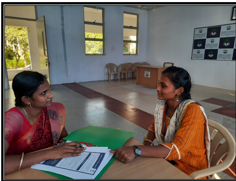
Glimpse of Girl Student Counseling