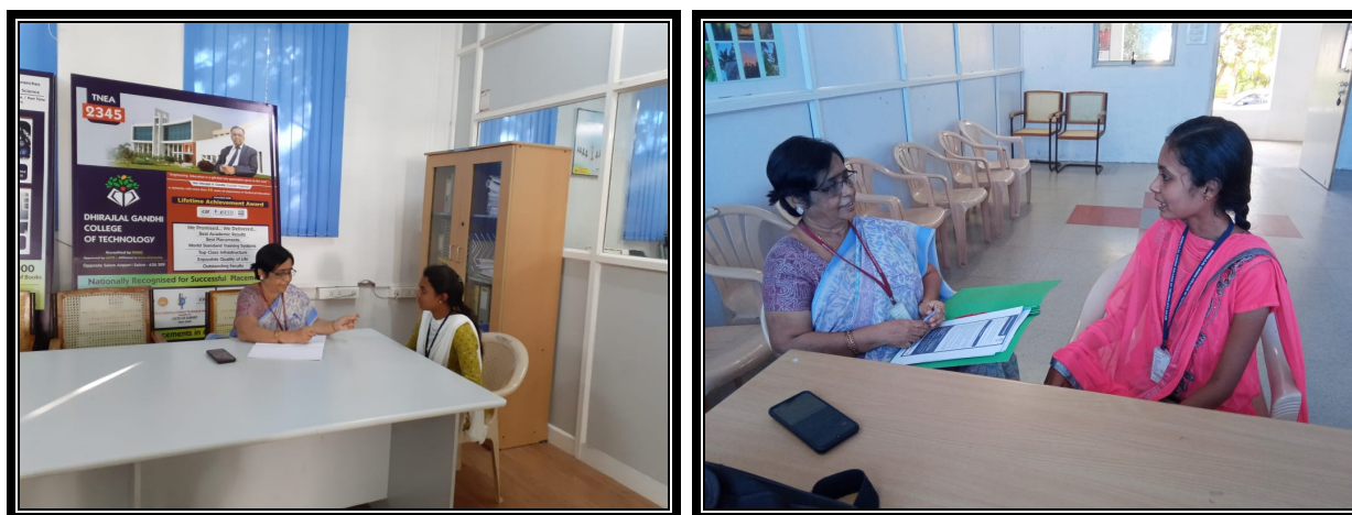
Glimpse of Girl Student Counseling