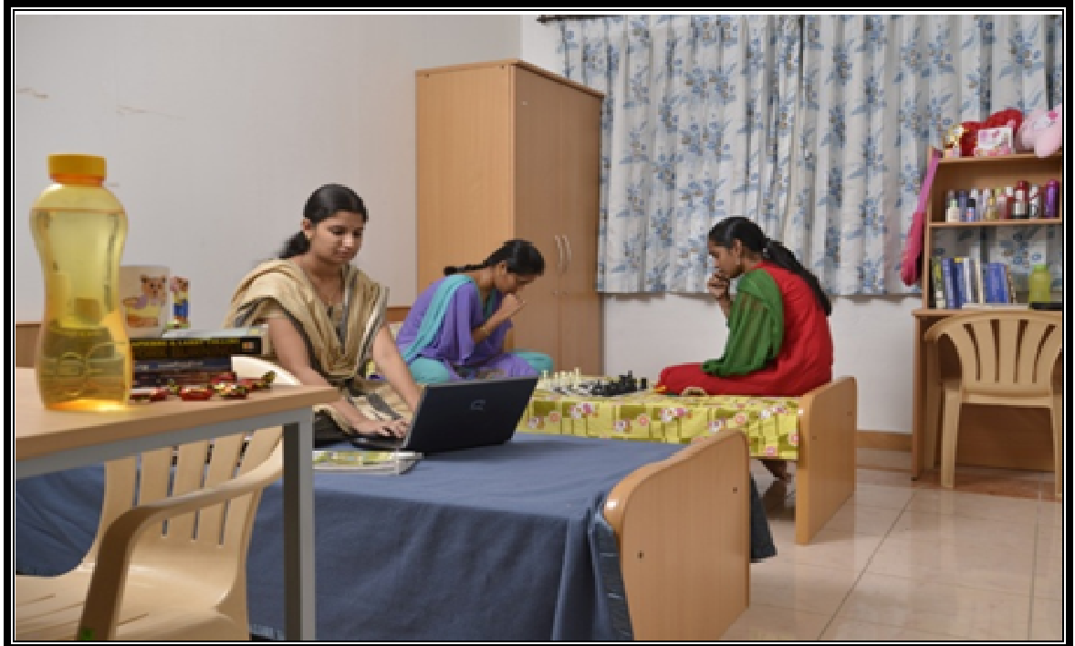
Separate Girls Hostel