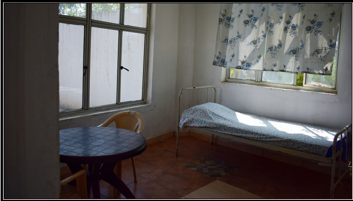
Day care center facility