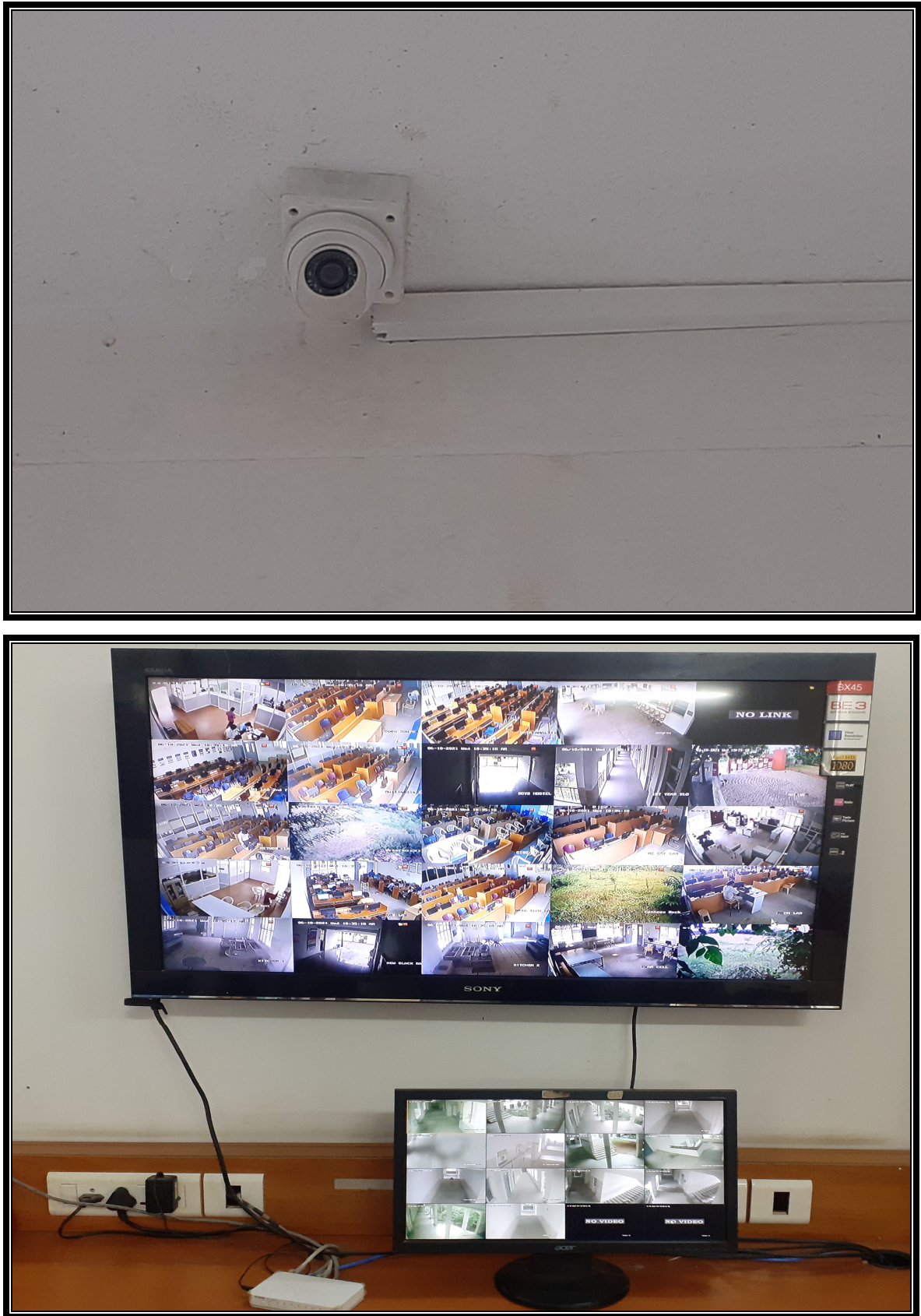
CCTV Camera facilities