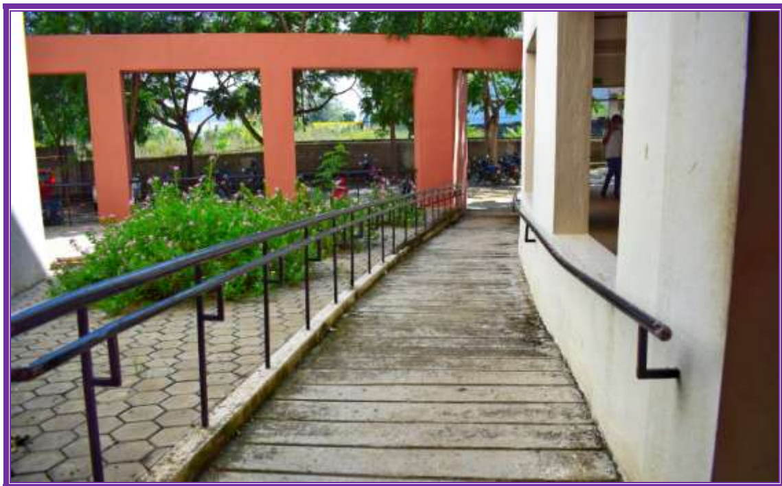
Ramp facility at DGCT main building