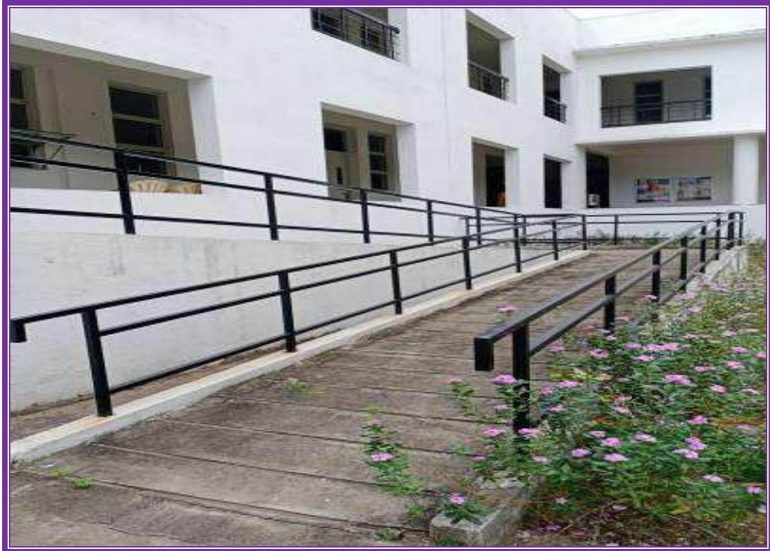
Ramp facility at DGCT new admin block