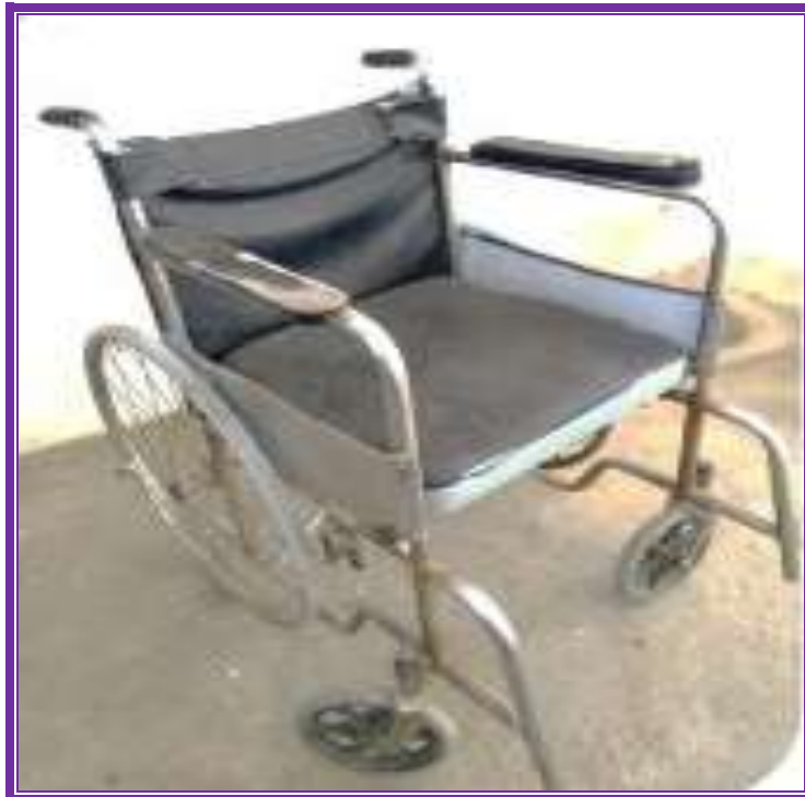
Wheel chair facility

The college provides special facilities for the differently abled students and persons to provide them opportunities to acquire quality education and to bring them into the main stream of the society. The college has a social responsibility and perception that differently abled students should be respected and treated as a normal human being.