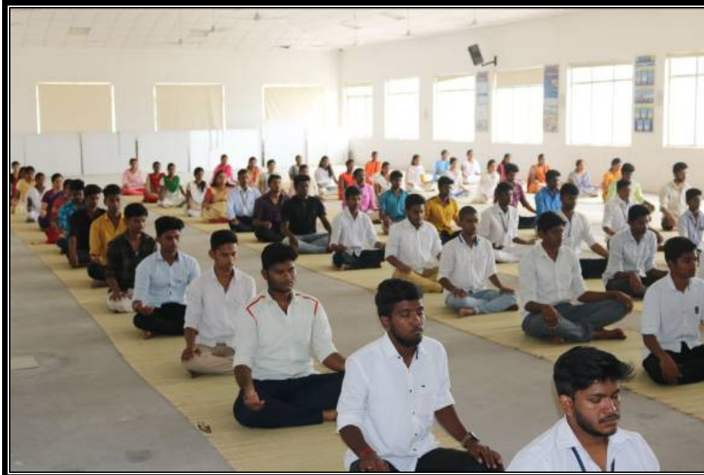
Students are doing Yoga practice at DGCT Auditorium