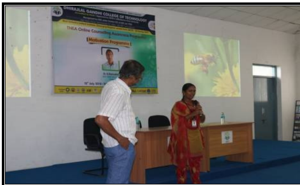
Student feed back in the Motivation program on MIND with VALUES