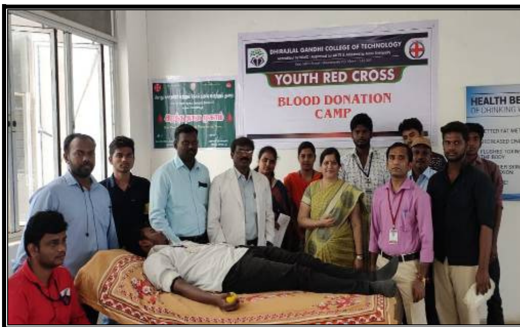
Student's contribution in the blood donation camp

Participants: Faculty members and Students