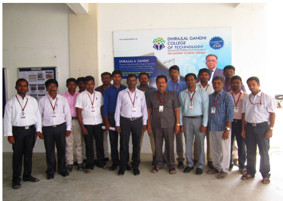
Faculty members participated in Awareness Programme on "Electrical and Mechanical maintenance of LIFT" conducted by TAMIL ELEVATORS on 29.12.2015.