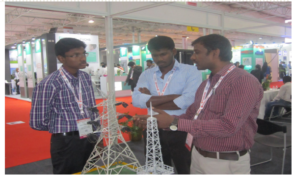
Head of the Department explained the concept of Power Transmission System to the students during the Exhibition Visit organized by ELECRAMA'16 @ Bangalore on 17.02.2016.