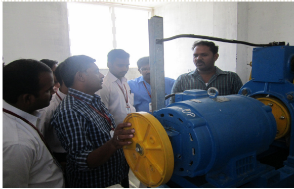
Faculty members interacted with the Service Engineer of TAMIL ELEVATORS during the Awareness Programme on 29.12.2015.