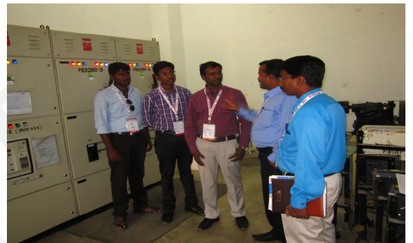
Faculty members & Students interacted with the Electrical Engineer during the Exhibition Visit organized by ELECRAMA'16 @ Bangalore on 17.02.2016.