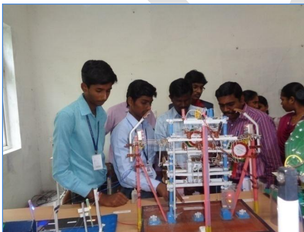
Model - Electrical power generation Transmission & Distribution