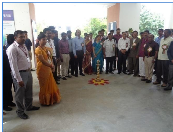
Lightning kuthu vizhaku- Engineer's day