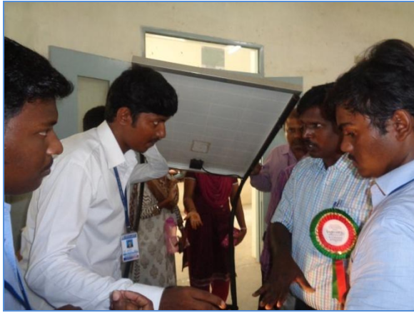
Hybrid smart Electric Vehicle