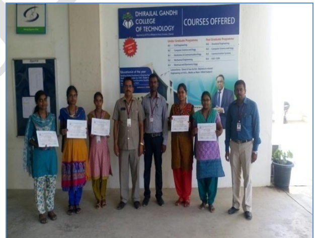
The students of III year EEE participate and won the prize for paper presentation held at K.S.R. College of Engineering, Namakkal on 02/09/2016.