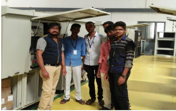
List of students attended in-plant training