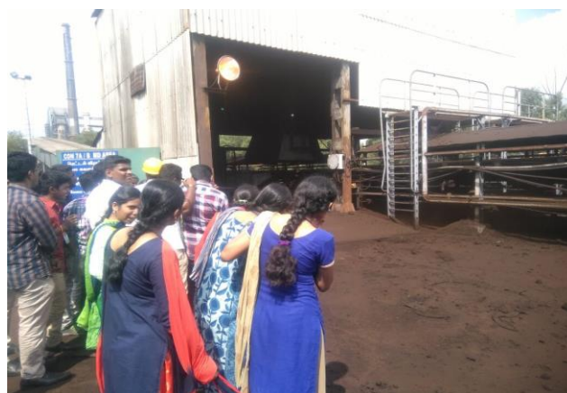
At NLC Pvt Ltd, Neyveli